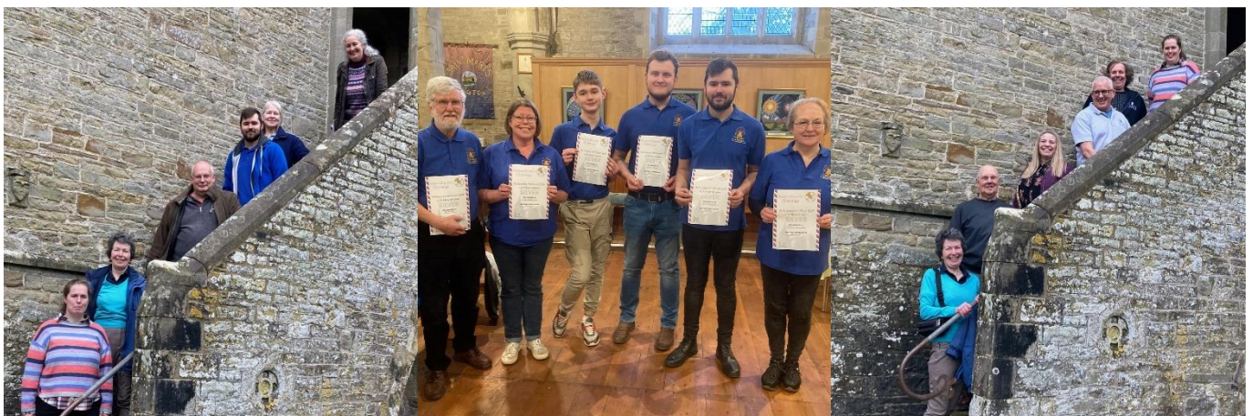
DISTRICT CALL CHANGE TEAM