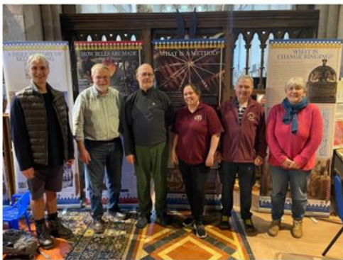
The band Treble to Tenor Right to Left at the rear of Cradley Church