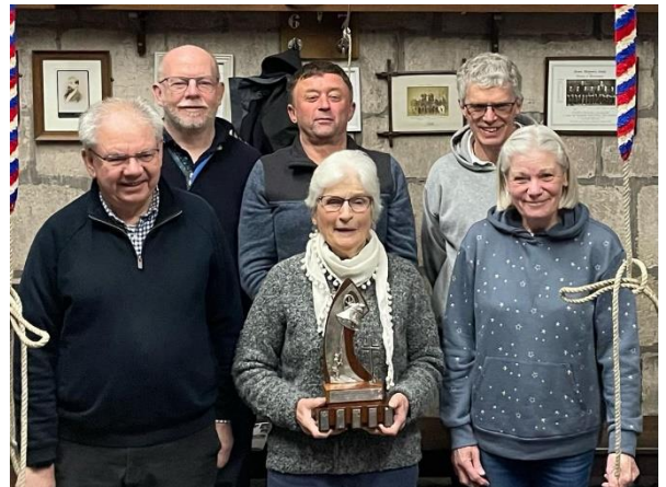
Current Holders of the Thomas Coper Trophy – Church Stretton District

Full details and competition rules will be available when the event is advertised later in the year.